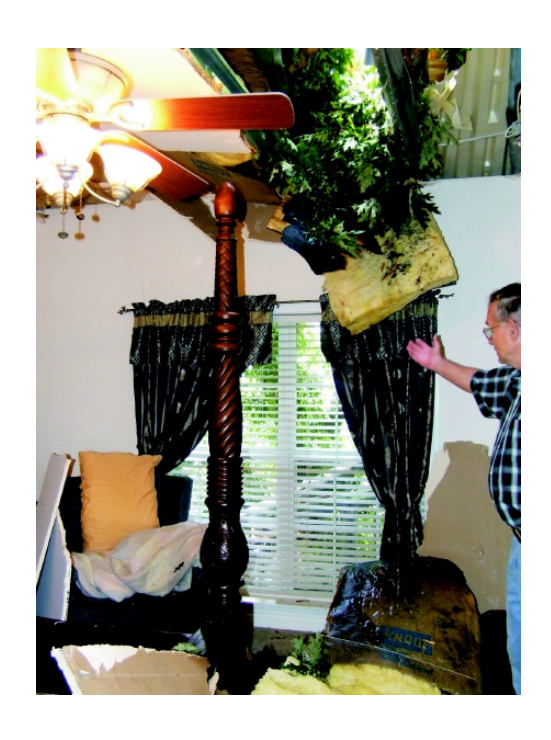
You can not even get your arms around that tree!

Our steel frame homes are engineered to meet any code in the world. We have supplied framing packages for wind codes in excess of 170 mph and in areas where seismic conditions are extreme.